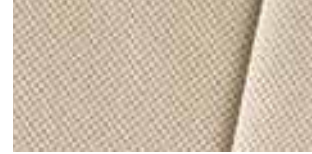
Limited perforated leather in Ivory 4, 5