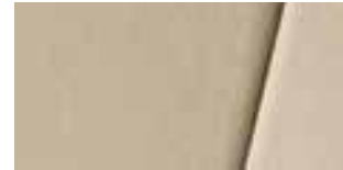
Avalon leather in Ivory 4,5