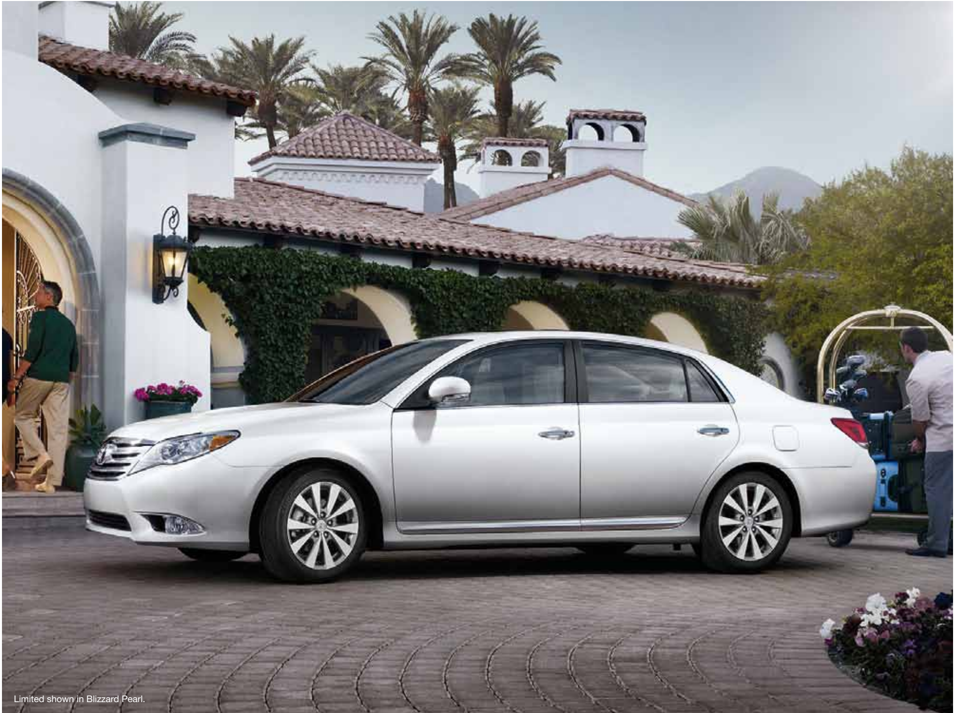
Limited shown in Blizzard Pearl.