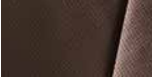
Limited perforated leather in Black Bordeaux 1, 2, 5