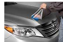
Paint protection film