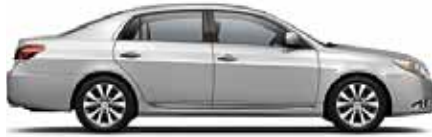
Classic Silver Metallic