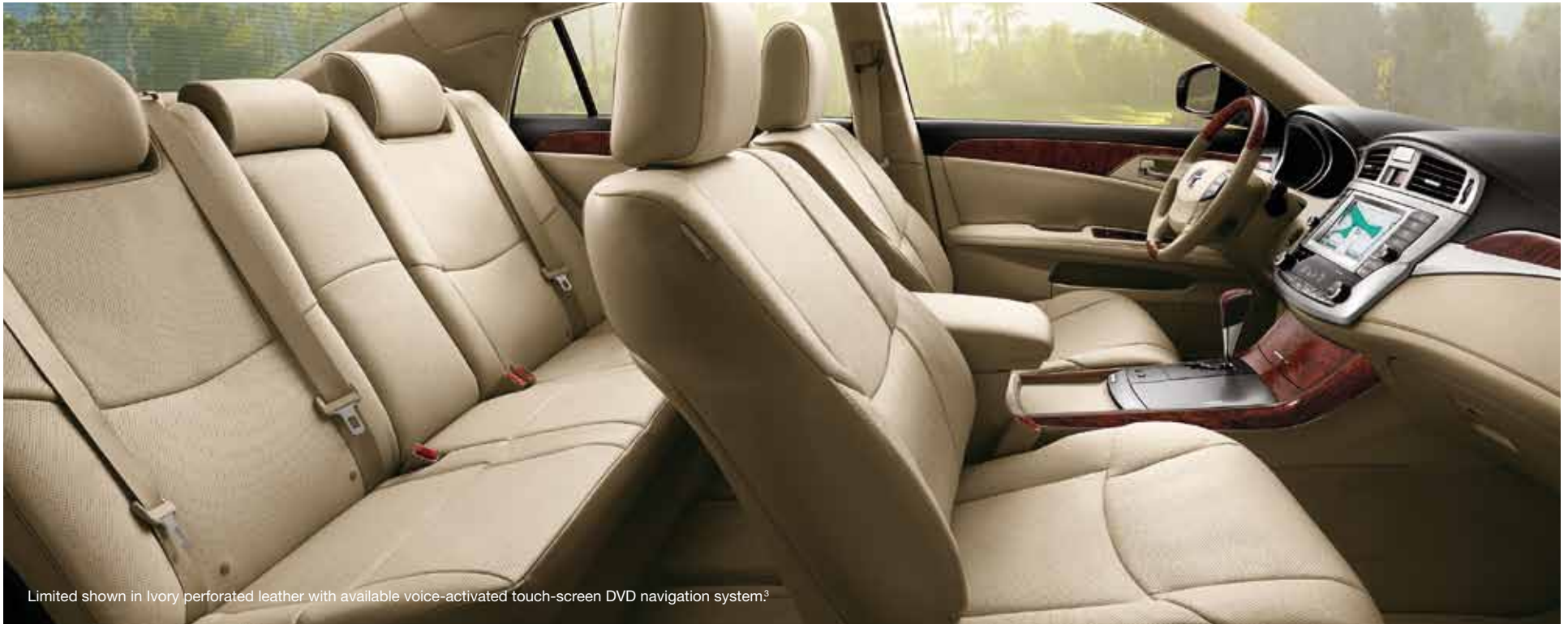
Limited shown in Ivory perforated leather with available voice-activated touch-screen DVD navigation system. 3

No matter which model grade you choose — Avalon or Limited — you'll be impressed by all the features that come standard. Step into the roomy interior and settle into the 8-way power driver's seat: It's leather-trimmed (perforated leather on Limited) and includes lumbar support. Grab hold: Switches for the audio and climate controls are integrated into your steering wheel. Check your rearview mirror: It integrates both a backup camera 1 and a HomeLink ®2 universal transceiver. Look overhead: That power tilt/slide glass moonroof is standard too. Prefer to relax in back? Avalon's nearly flat rear-floor design enhances rear leg room, while the reclining rear seats put you entirely at ease.