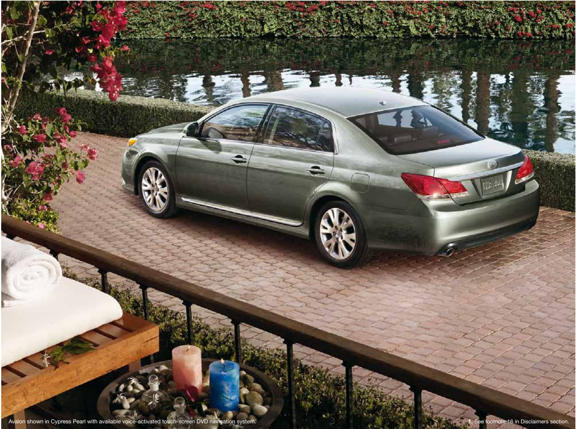
Avalon shown in Cypress Pearl with available voice-activated touch-screen DVD navigation system!

1. See footnote 16 in Disclaimers section.