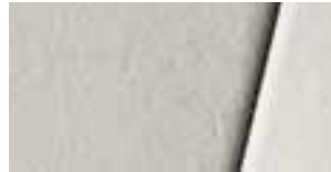
Avalon leather in Light Gray 1,3