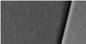
Avalon leather in Black 1,2