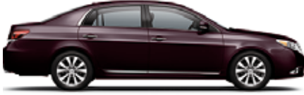
Sizzling Crimson Mica