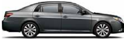
Magnetic Gray Metallic