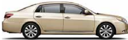
Sandy Beach Metallic