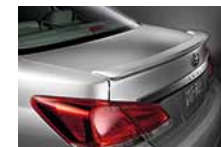
Rear spoiler 24