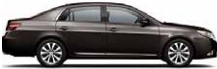
Cocoa Bean Metallic