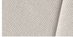
Limited perforated leather in Light Gray 1, 3