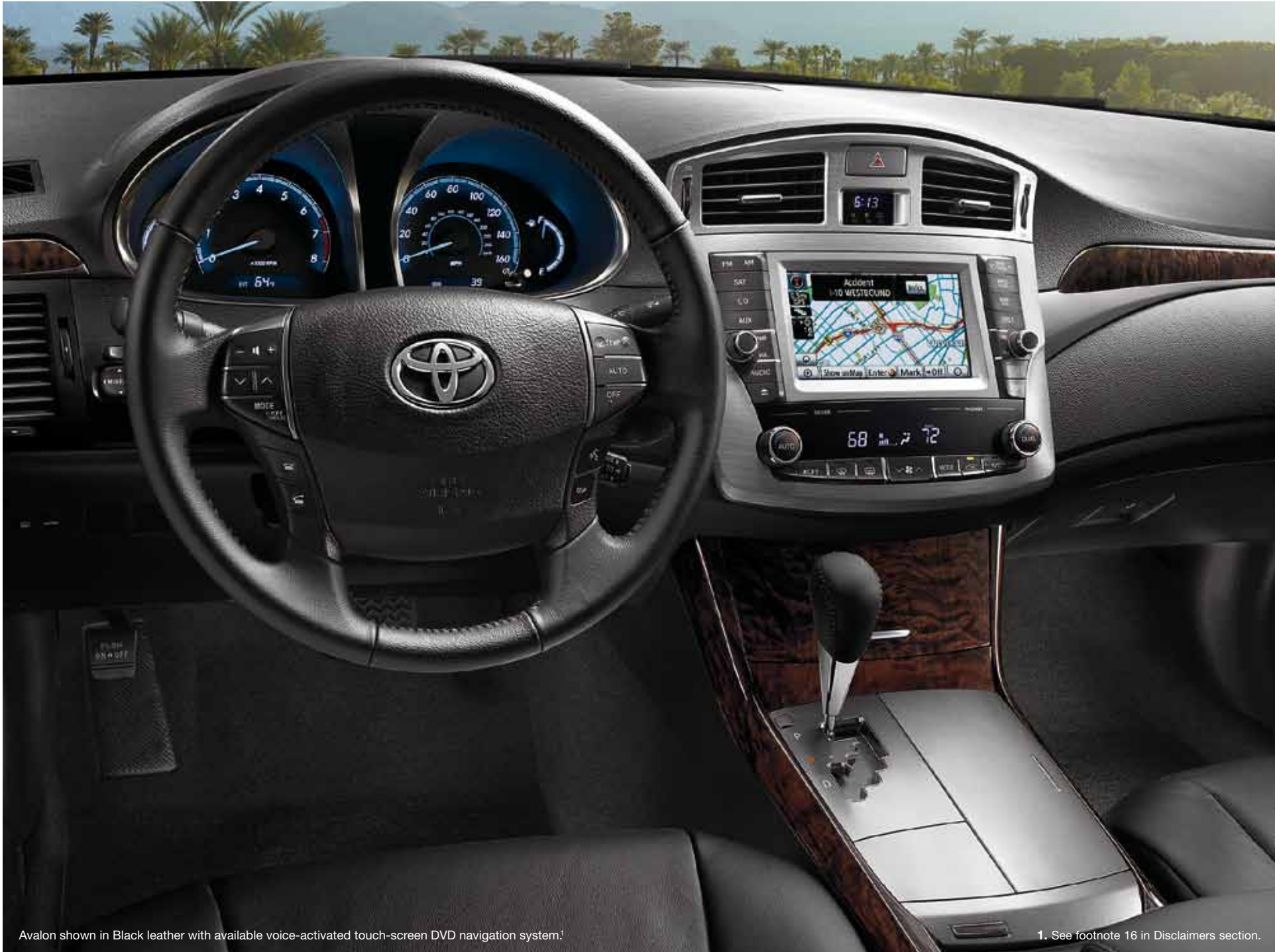
Avalon shown in Black leather with available voice-activated touch-screen DVD navigation system. 1