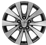
Limited 17-in. dual 5-spoke alloy wheel