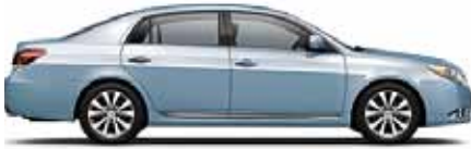
Zephyr Blue Metallic