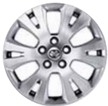
Avalon 17-in. split 6-spoke alloy wheel